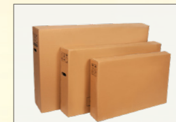
大型家電瓦楞紙箱 Large appliance corrugated cartons.