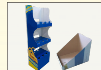
廣告展示架/陳列架 POP / Display shelf.